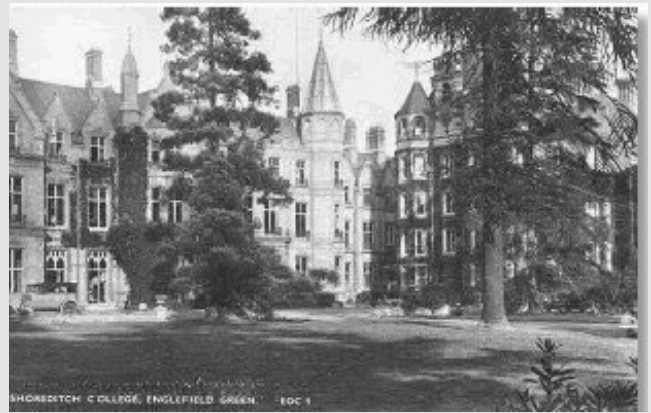
Photo of Audley Cooper's Hill from the 1950's

Over the years the current site of Audley's Cooper's Hill has been passed through the hands of many notable owners. It was once owned by Lord Andrew Windsor in 1539, having been granted it by King Henry VIII, and passed on to the Harcourt family in the 18th Century. They remained in the old manor house until the start of the 19th Century when they built a new house on the current site, and the property became known as 'Coopershill'.