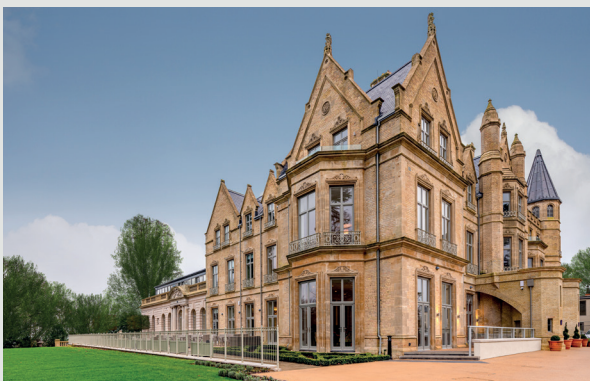
Audley Cooper's Hill luxury retirement village

Now, the Cooper's Hill site is home to Audley's retirement village. Every effort to preserve and celebrate the history of the area continues to be made, and the first owners moved in in autumn 2019.